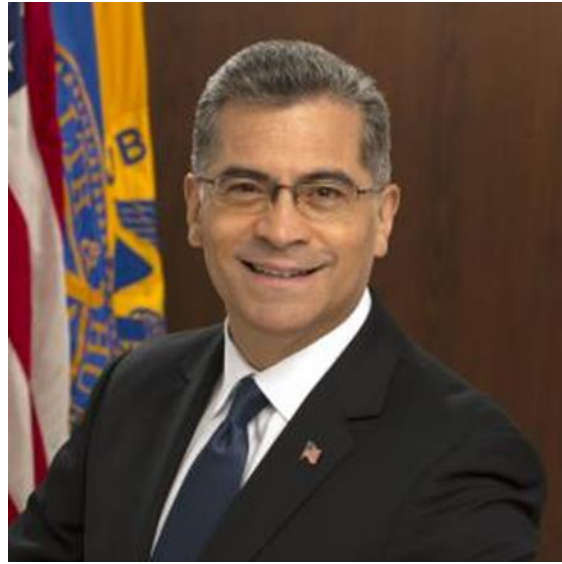
Secretary Xavier Becerra