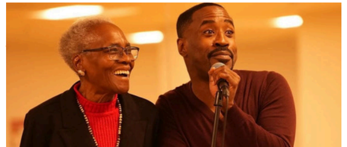
World AIDS Day 2024